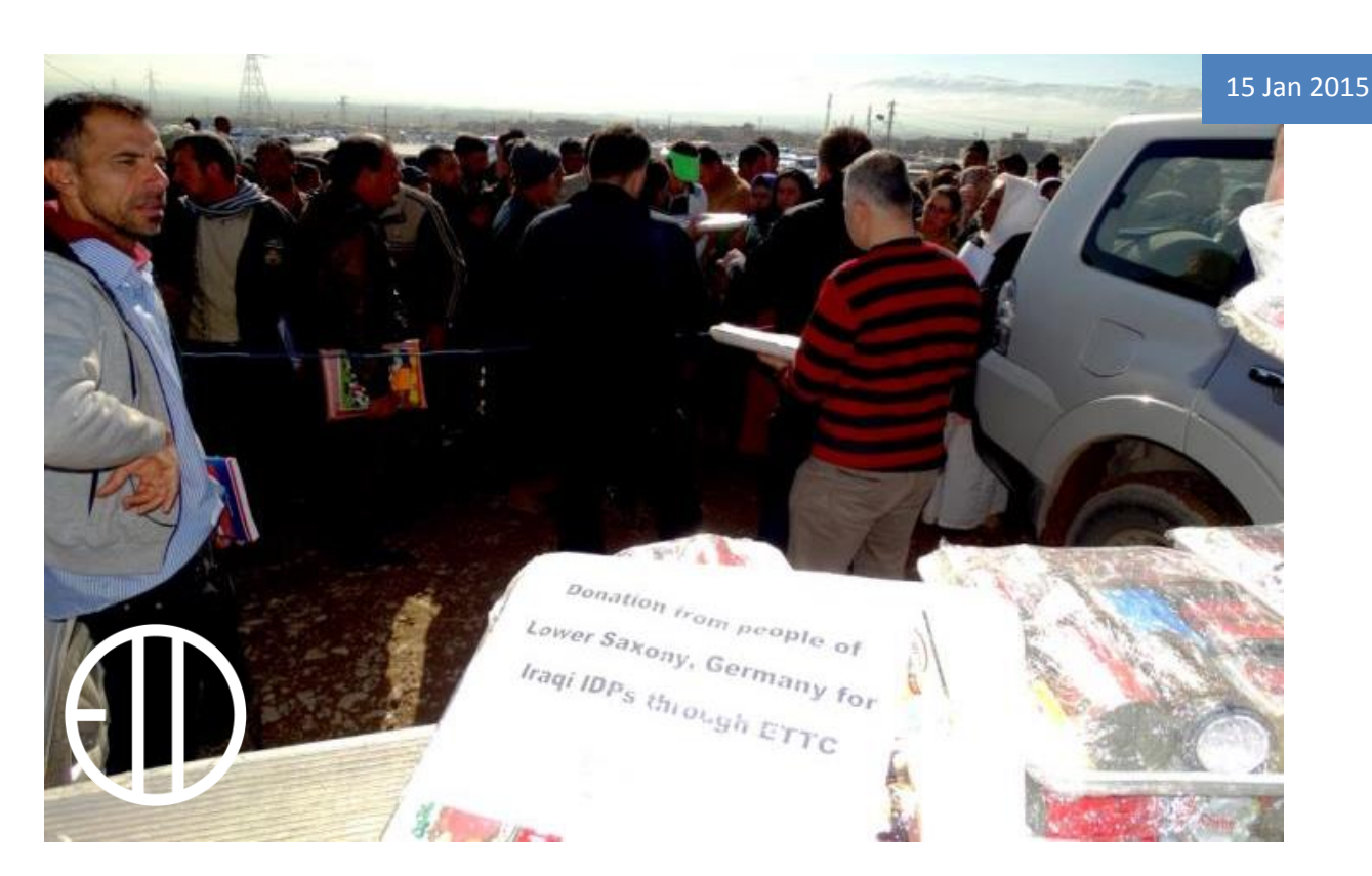
IDPs lined up to receive the food packages donated by the people of Lower Saxony, Germany

ETTC to provide the third humanitarian aid in Suleimaniyah for the IDPs donated by the people of Lower Saxony, Germany. The package contained canned food for 1250 families.